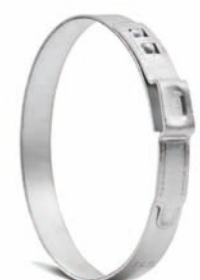
OEM Ear clip