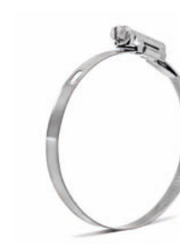
Worm drive hose clip with antirotation feature. ASFA L and S