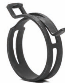
DIN 3021 Spring-band clip