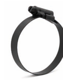
Worm-Drive hose clip Black finish. ASFA L and S

W1 W2 W3 W4 W5 | From Ø 8-12 To Ø 140-160