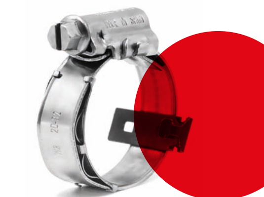
ASFA CT with pre-assembly clip ASFA L and S