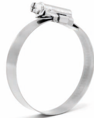
Worm-drive hose clip ASFA S-PRO (12 mm)

W1 W2 W3 W4 W5 | From Ø 16-27 To Ø 220-240