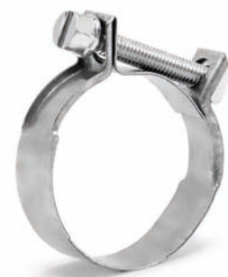
"Normal" Mini Clip