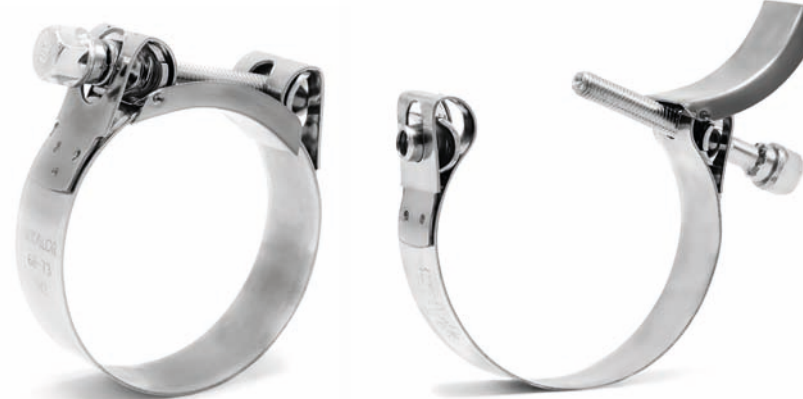
Supra heavy-duty clamp