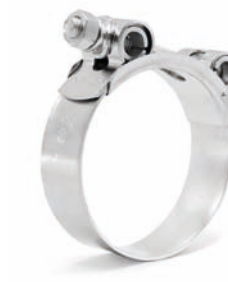
Super heavy-duty clamp