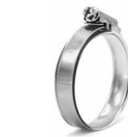
Worm-drive hose clip with inner ring. ASFA L and S

W1 W2 W3 W4 W5 | From Ø 16-27 To Ø 220-240