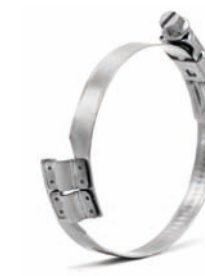
Double bridge Worm-Drive hose clip. ASFA L and S

W1 W2 W3 W4 W5 | From Ø 8-12 To Ø 220-240