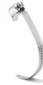
Open Worm-drive clip