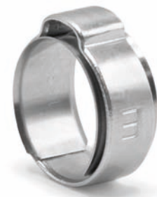
One ear clip with inner ring