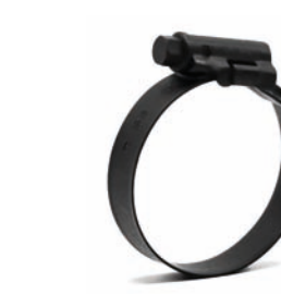
ASFA S-PRO TITANIUM Worm-Drive hose clip

W1 W2 W3 W4 W5 | From Ø 16-27 To Ø 220-240