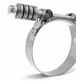
Supra CT Constant Tension heavy-duty clamp