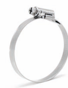
Worm-Drive hose clip ASFA L (9 mm)

W1 W2 W3 W4 W5 | From Ø 8-12 To Ø 140-160