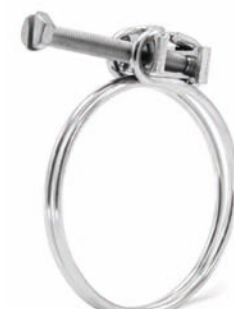
Wire clip with screw