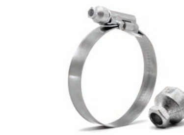
Torque Cap for ASFA L and S Worm-drive hose clips

W1 W2 W3 W4 W5 | From Ø 8-12 To Ø 220-240