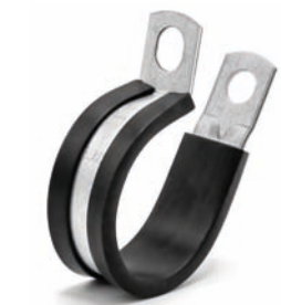
SMS Rubber-lined P-Clip

W1 W2 W3 W4 W5 | From Ø 25-40 To Ø 220-240