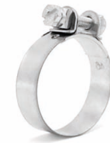
Fixed diameter S-Clamp

W1 W2 W3 W4 W5 | From Ø 16-27 To Ø 220-240