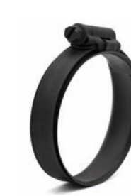
Worm-drive hose clip with black inner ring. ASFA L and S

W1 W2 W3 W4 W5 | From Ø 16-27 To Ø 220-240